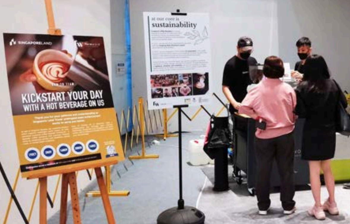
Mobile Coffee Cart (Singapore Land Group)