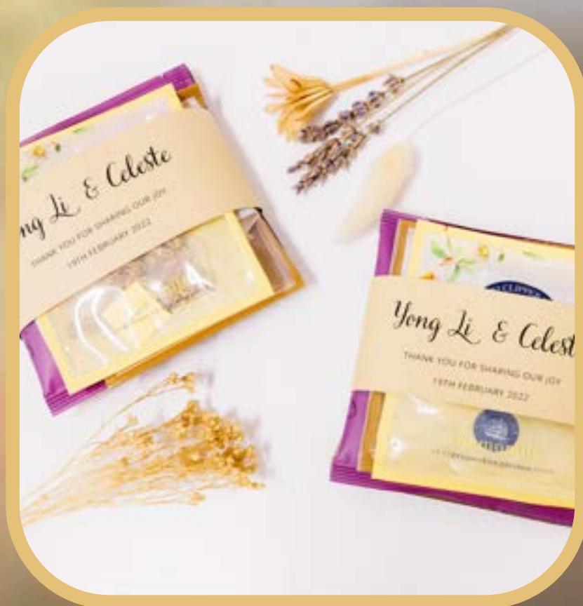
Customised brown kraft bellyband @ $0.55/set