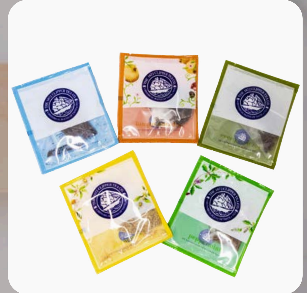
Clipper Tea Bags