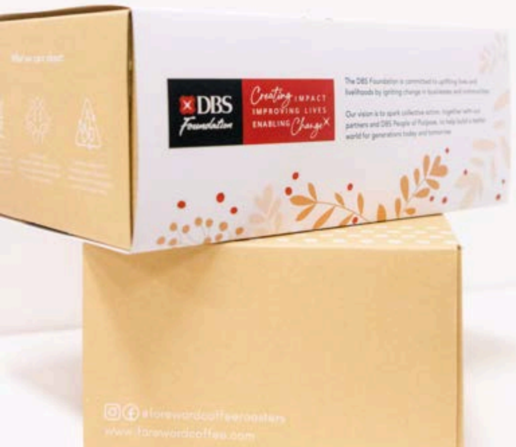
Seasons Greetings Gift Bundle