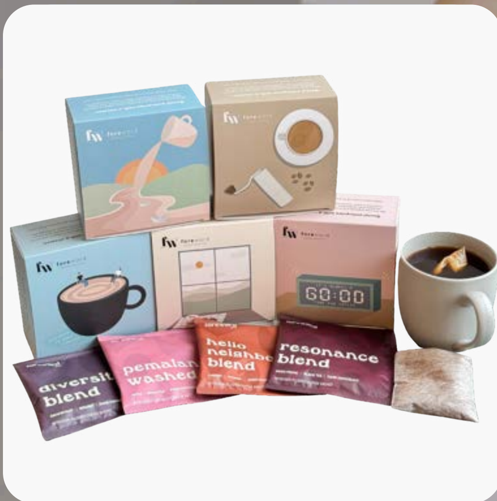
Coffee Brew Bags