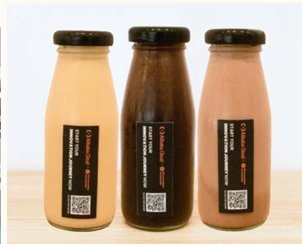
Custom Bottled Drinks (Alibaba Cloud)