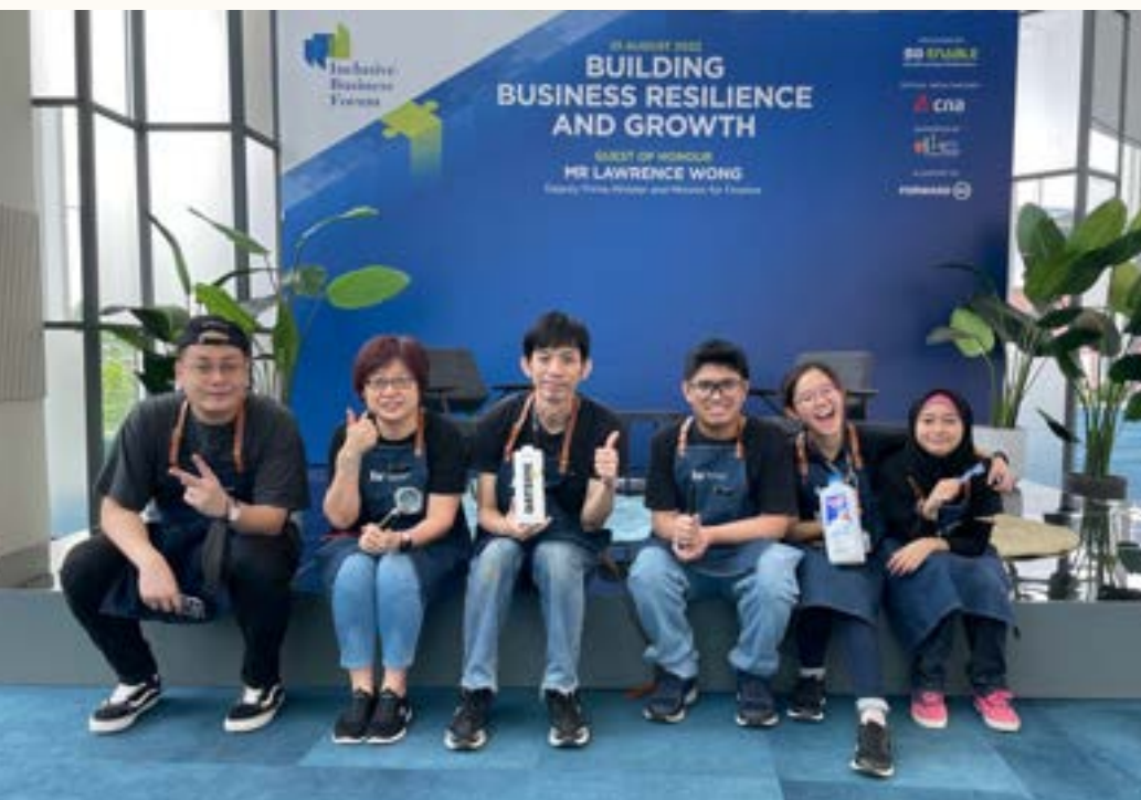
Catering for Inclusive Business Forum