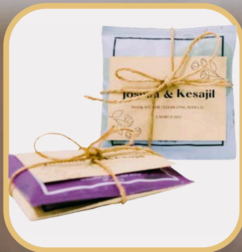
Twine with kraft note @ $0.87/set