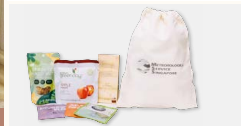
Employee Care Packs (MSS)