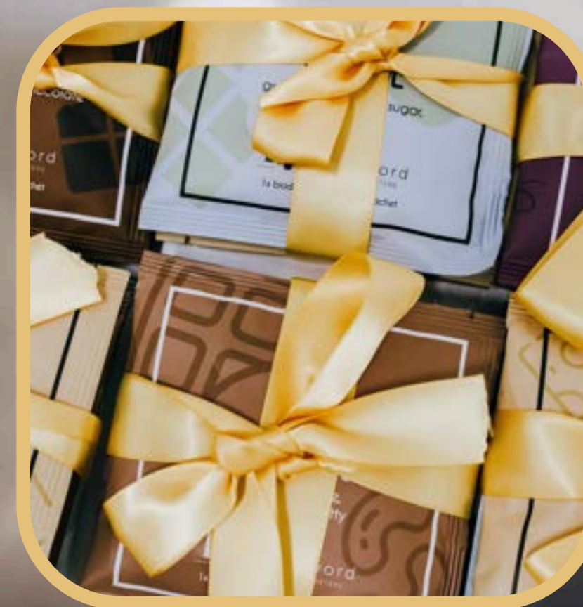
Satin ribbon with custom note @ $1.09/set

Note: Prices stated are for packaging only, inclusive of 9% GST.