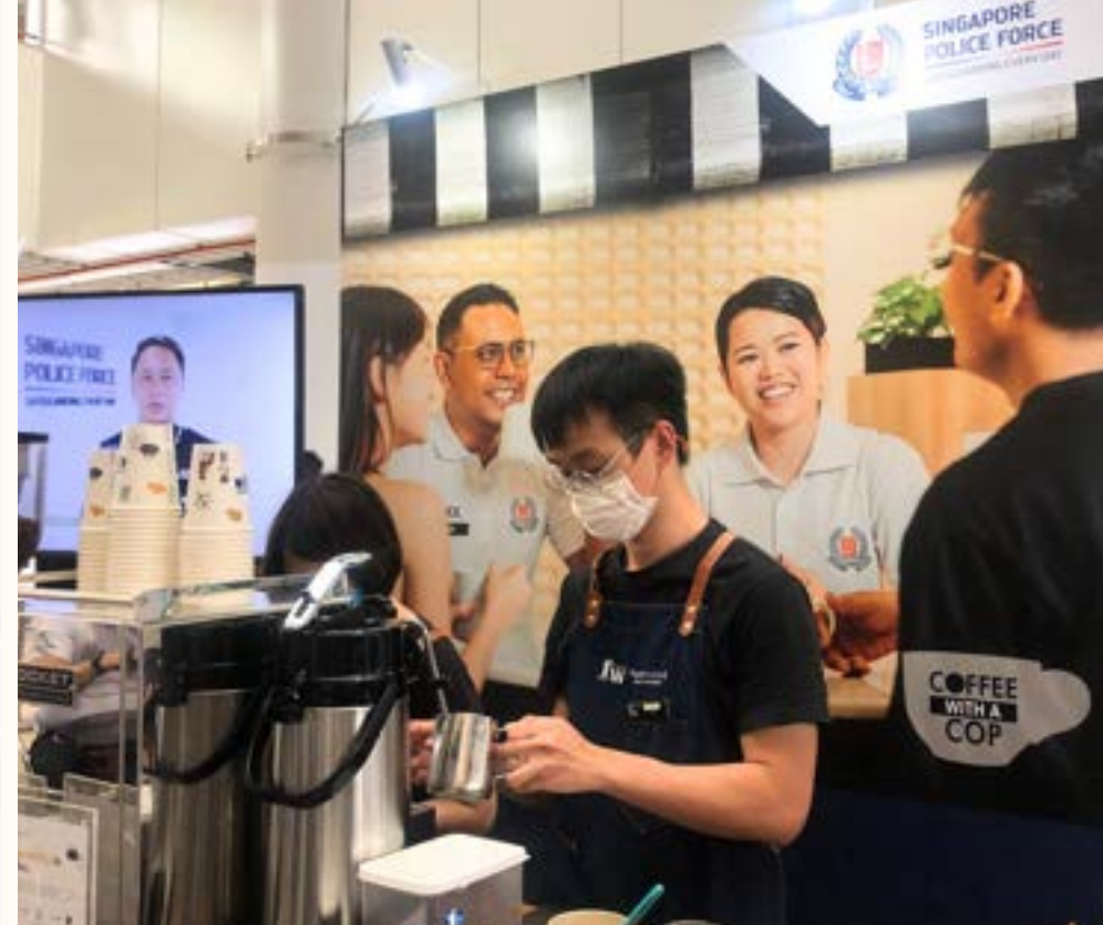
Launch of 'Coffee with a Cop'