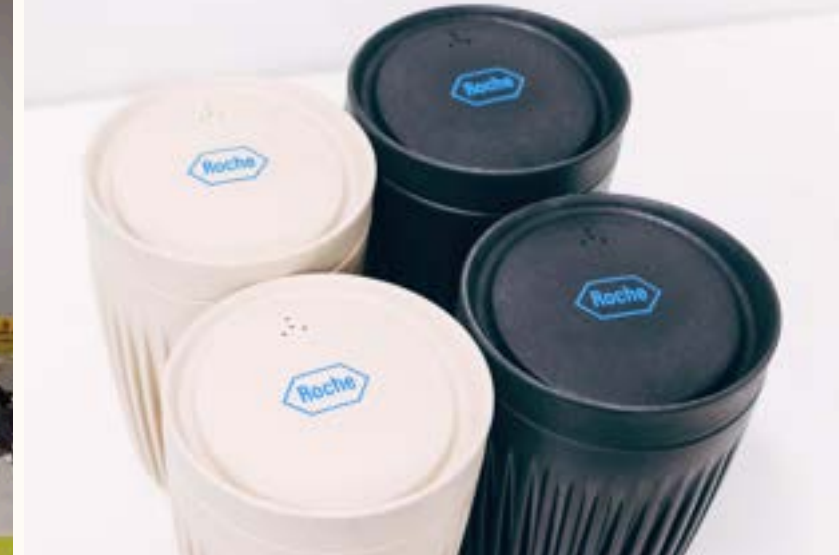
Custom HuskeeCups (Roche)