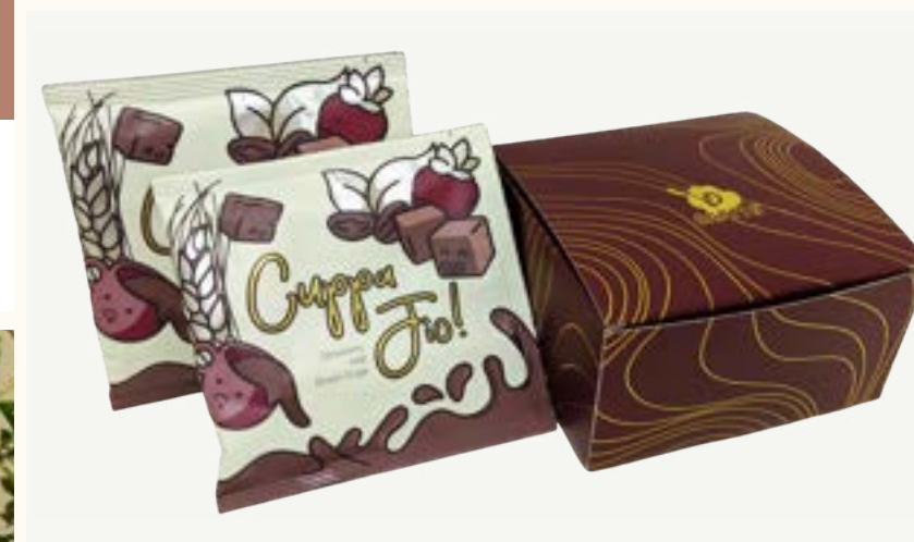
Coffee Brew Bags (NUS CAPT)