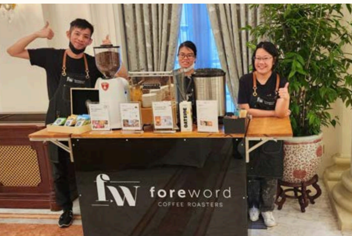
Community Chest Awards 2022