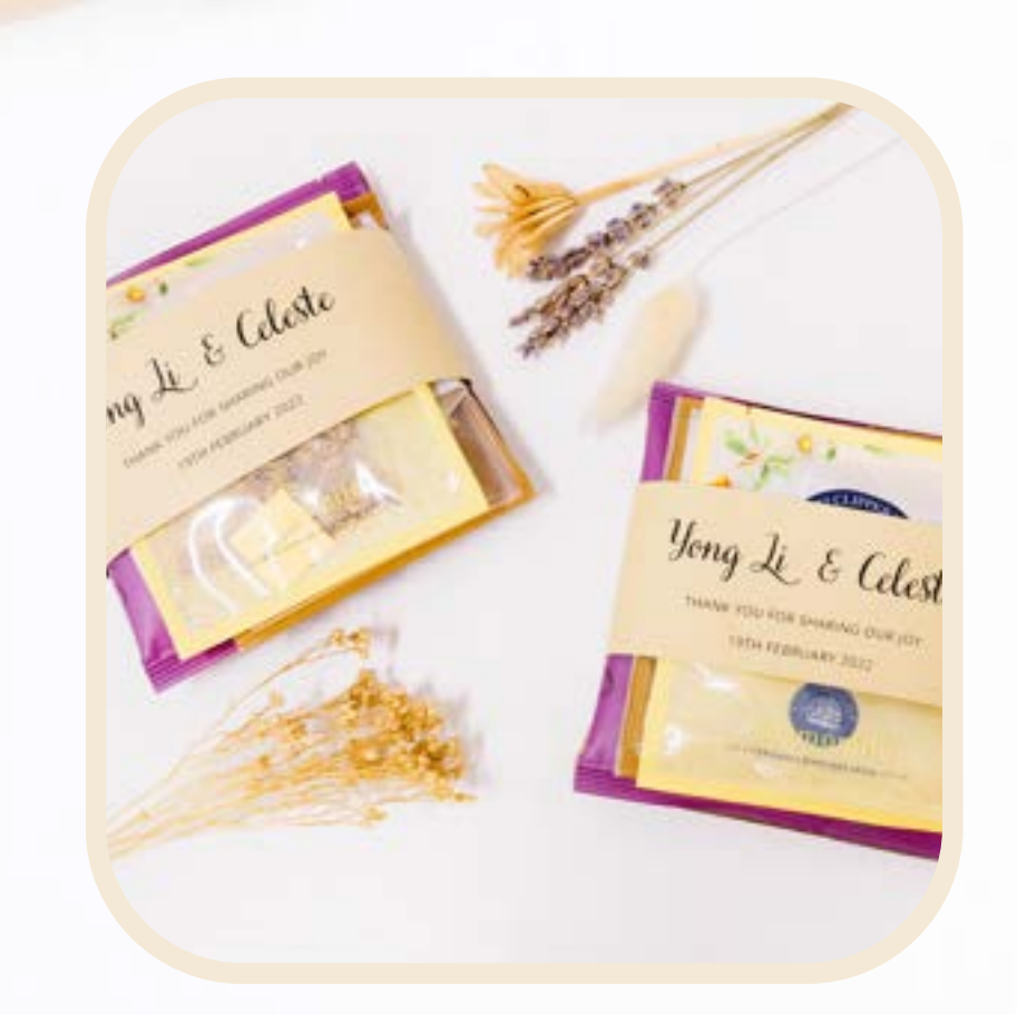
Customised brown kraft bellyband @ $0.55/set