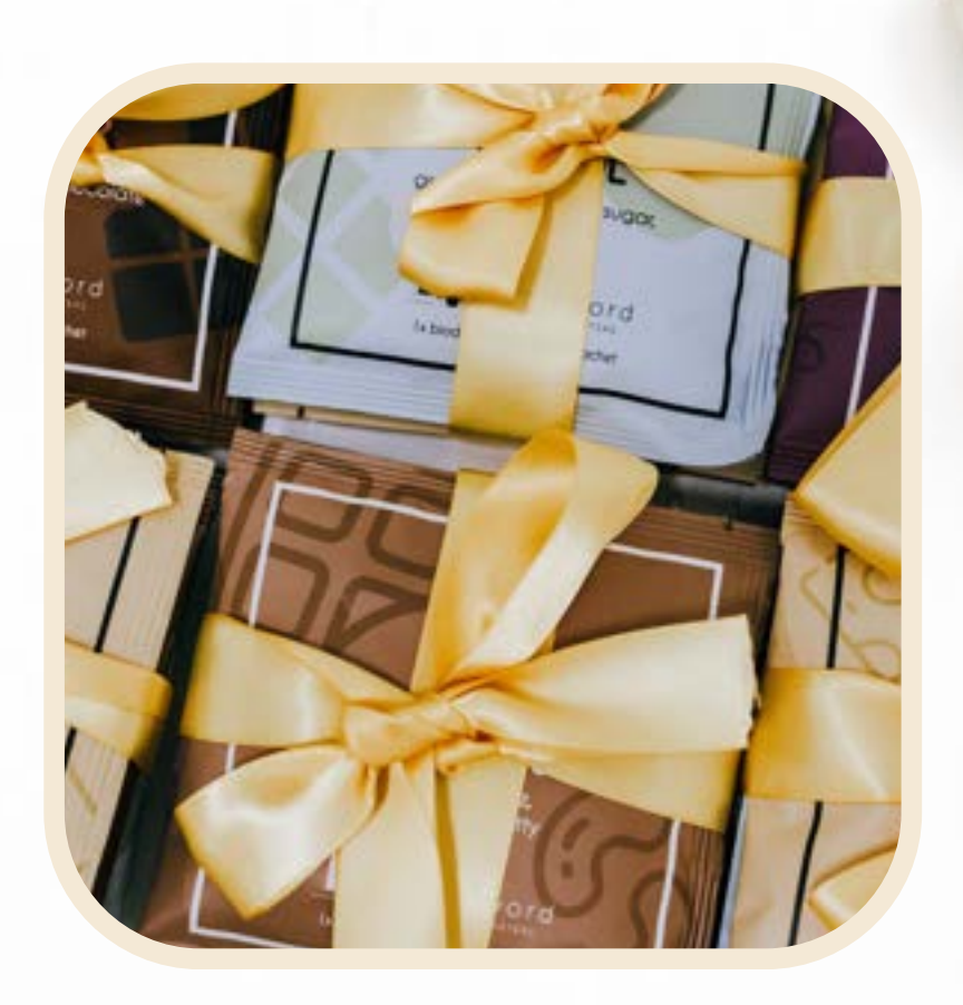
Satin ribbon with custom note @ $1.09/set