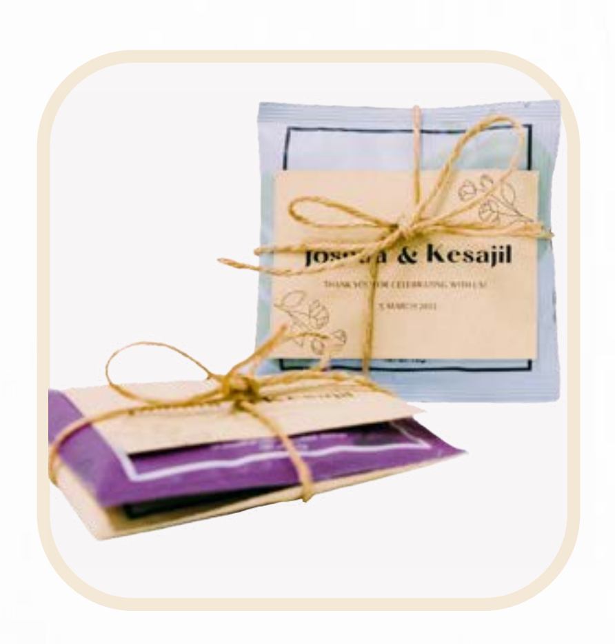
Twine with kraft note @ $0.87/set