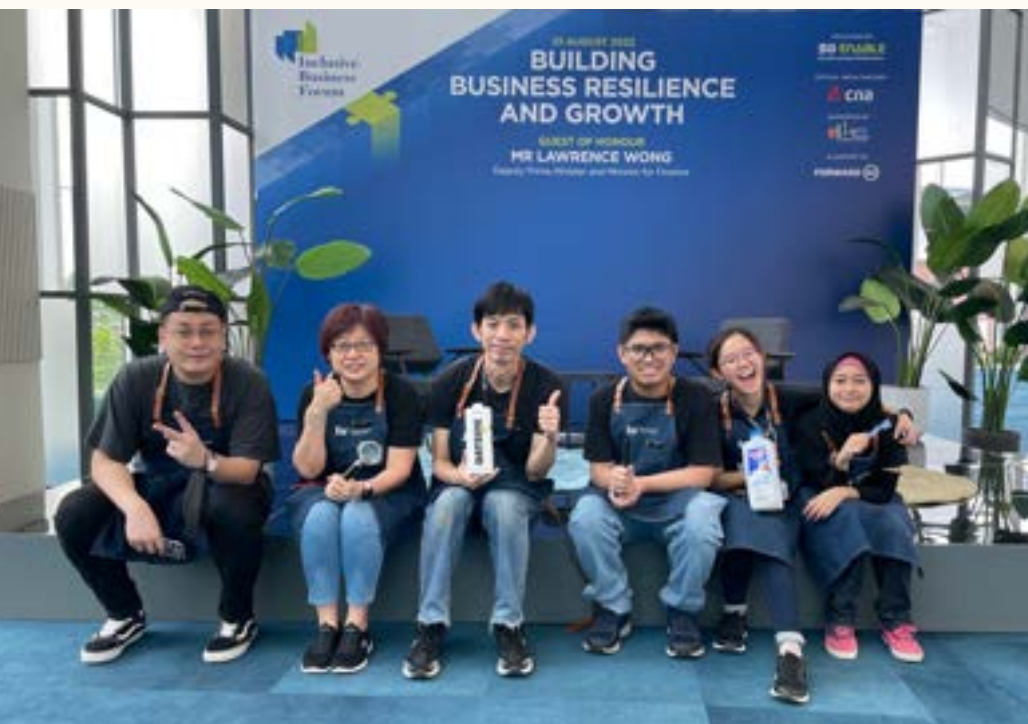
Catering for Inclusive Business Forum