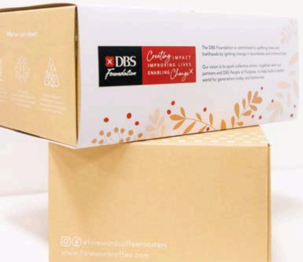
Seasons Greetings Gift Bundle